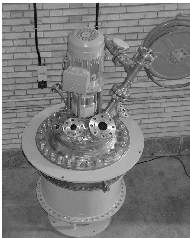
Figure 3: 100 L pressure reactor (Disal Co., Iran) used for pilot scale preparation of Topanol A General procedure for preparation of Topanol A.

Aluminum (1 wt. % of phenol) was added to phenol in a stainless steel pressure reactor. The contents of the reactor were then heated to 170 °C and maintained at that temperature for an hour during which aluminum formed aluminum phenolate (Al(OPh) 3 ) by dissolving in phenol and liberating hydrogen gas. The reaction mixture was then cooled to 50 °C, and the hydrogen gas released was carefully and slowly released. Isobutylene gas collected in a stainless steel pressure vessel was then quickly injected into the reactor forced by nitrogen gas pressure. The reaction mixture was then heated to 110 °C in 30 minutes and maintained at that temperature for the next 3 hours. The pressure initially increased to 200-300 psi, and then slowly dropped as isobutylene was consumed.